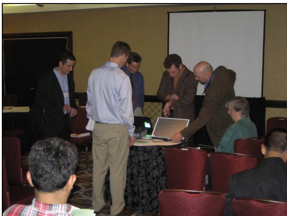
Sometimes technology wins: A star-studded group of ASREC members attempt to solve a technological glitch before session C9. The problem was eventually solved, and the session went on as planned.