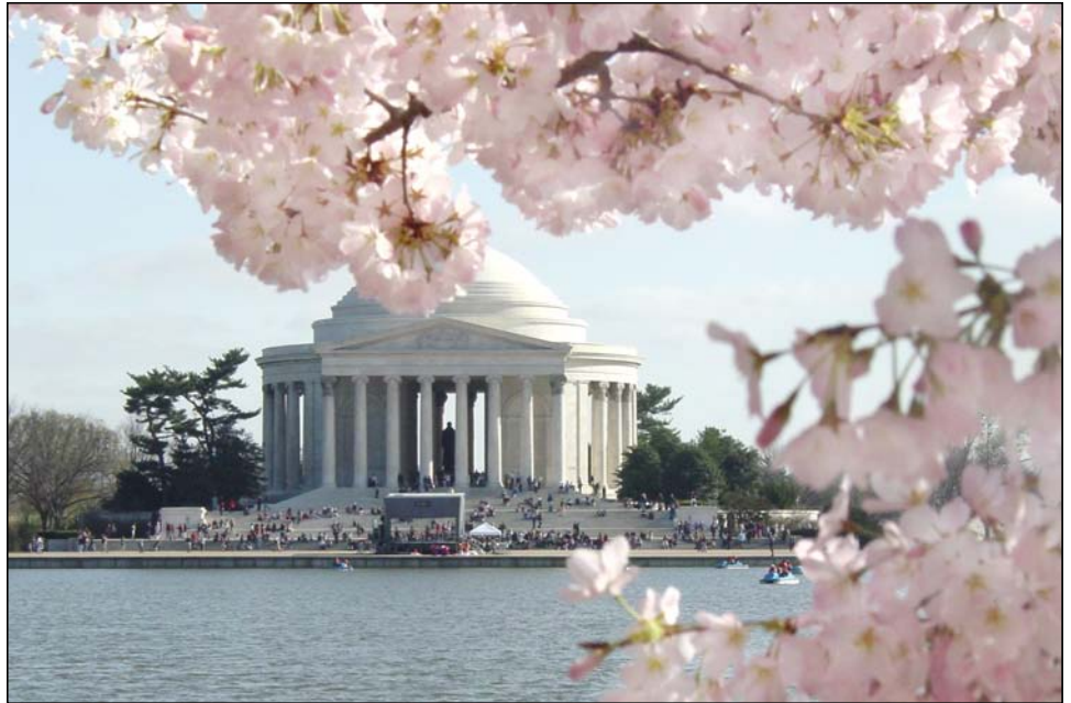
Cherry blossoms in full bloom on a spring day near the Jefferson Memorial in Washington, D.C.

The move to Washington is also designed to attract a broader range of conference participants – more scholars and students from economics, politi-